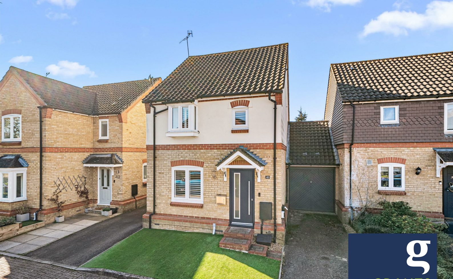
Kaye Don Way, Weybridge, KT13 0UX