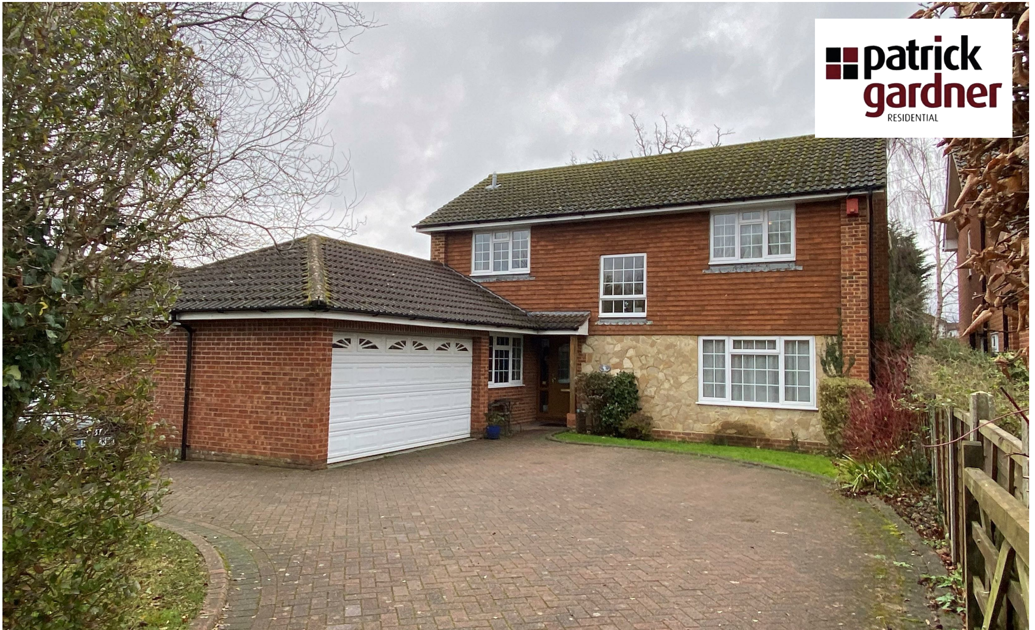
Kerkyra House 28a Childs Hall Road, Bookham, Surrey, KT23 3QG