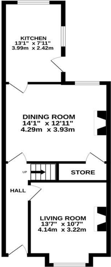
GROUND FLOOR 491 sq.ft. (45.6 sq.m.) approx.