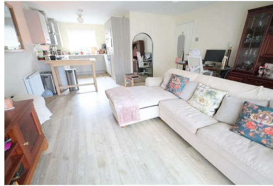
Ground Floor Apartment