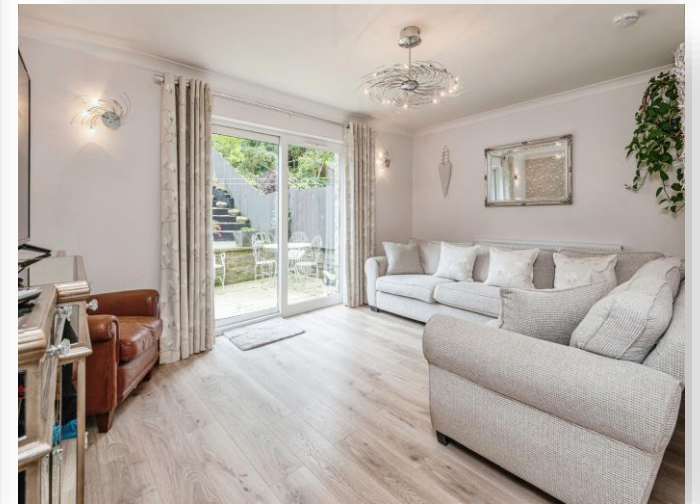
Lower Mill Lane, Holmfirth HD9 2JB