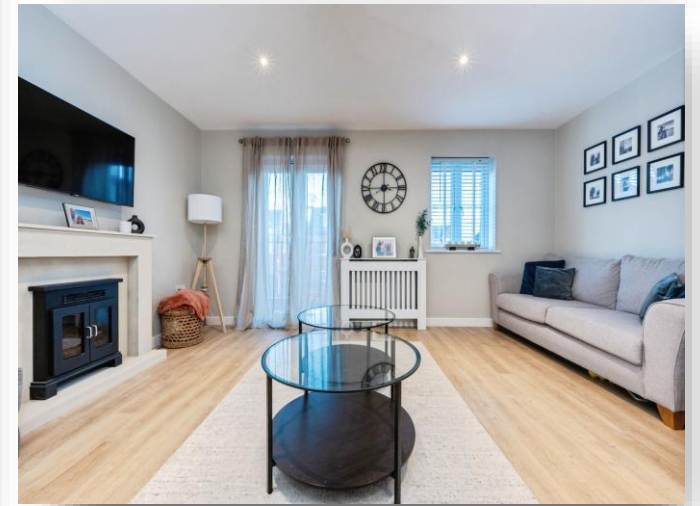
Sandpiper Way, Leighton Buzzard, LU7 4SS