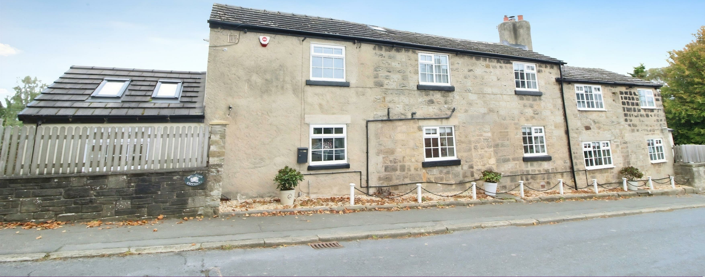
Hillside Cottage Sandhills, Thorner, LS14 3DF £599,995