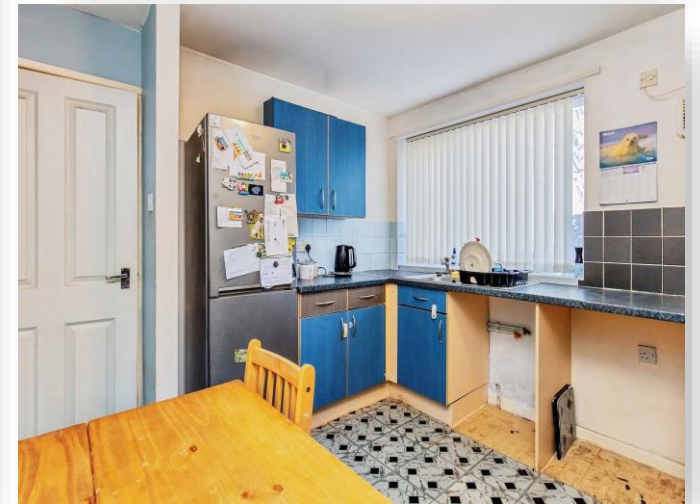
9 Hamilton House Elizabeth Street, Corby NN17 1SG