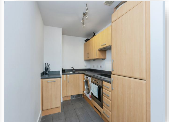
Alexandra House Rutland Street, Leicester LE1 1SQ