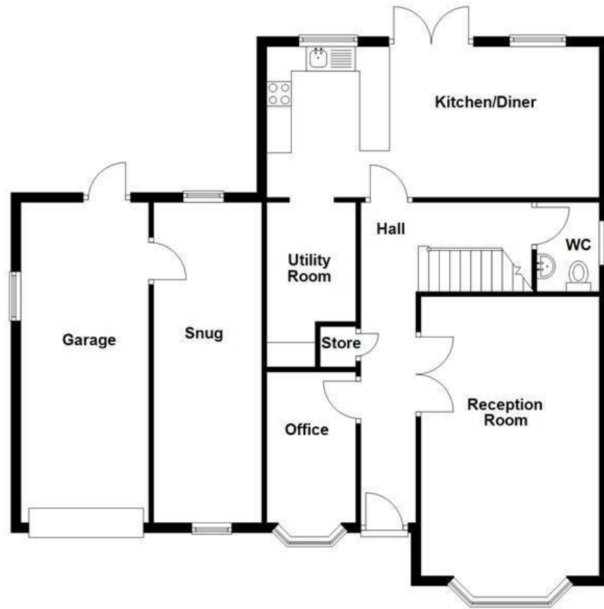
Ground Floor Approx. 102.9 sq. metres (1107.3 sq. feet)