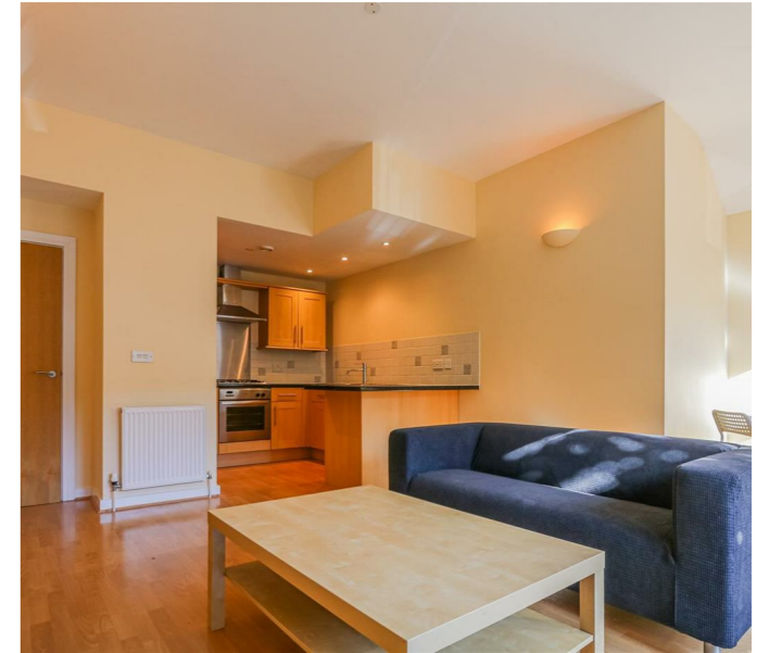
Thomas Court, Penylan