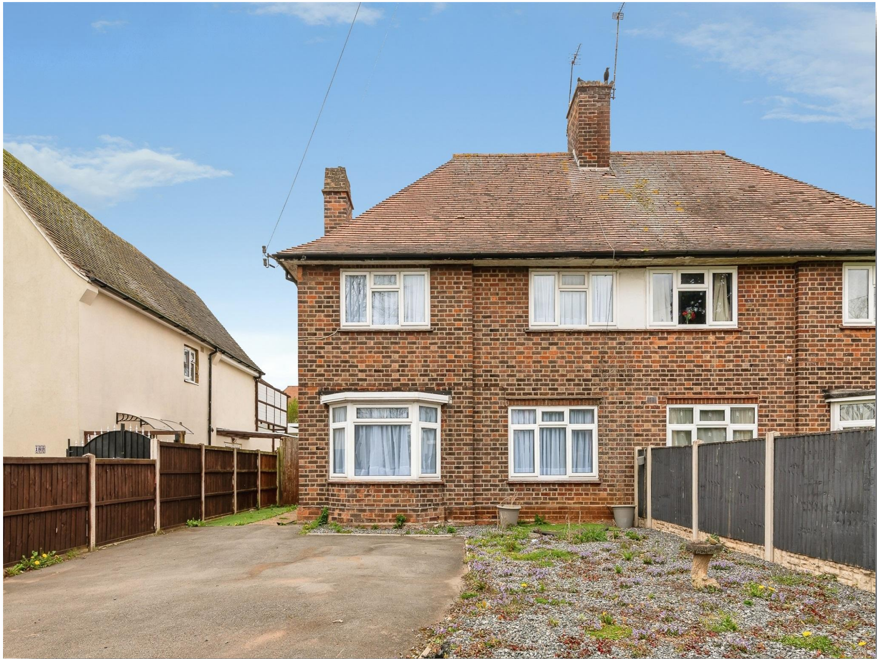
Melbourne Road, Nottingham NG8 5HH