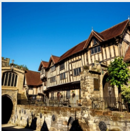
Lord Leycester Hospital