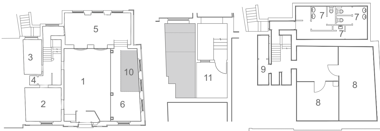
Lower Ground and Basement