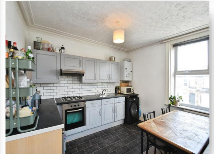
Mayfield Grove, Harrogate HG1 5HD