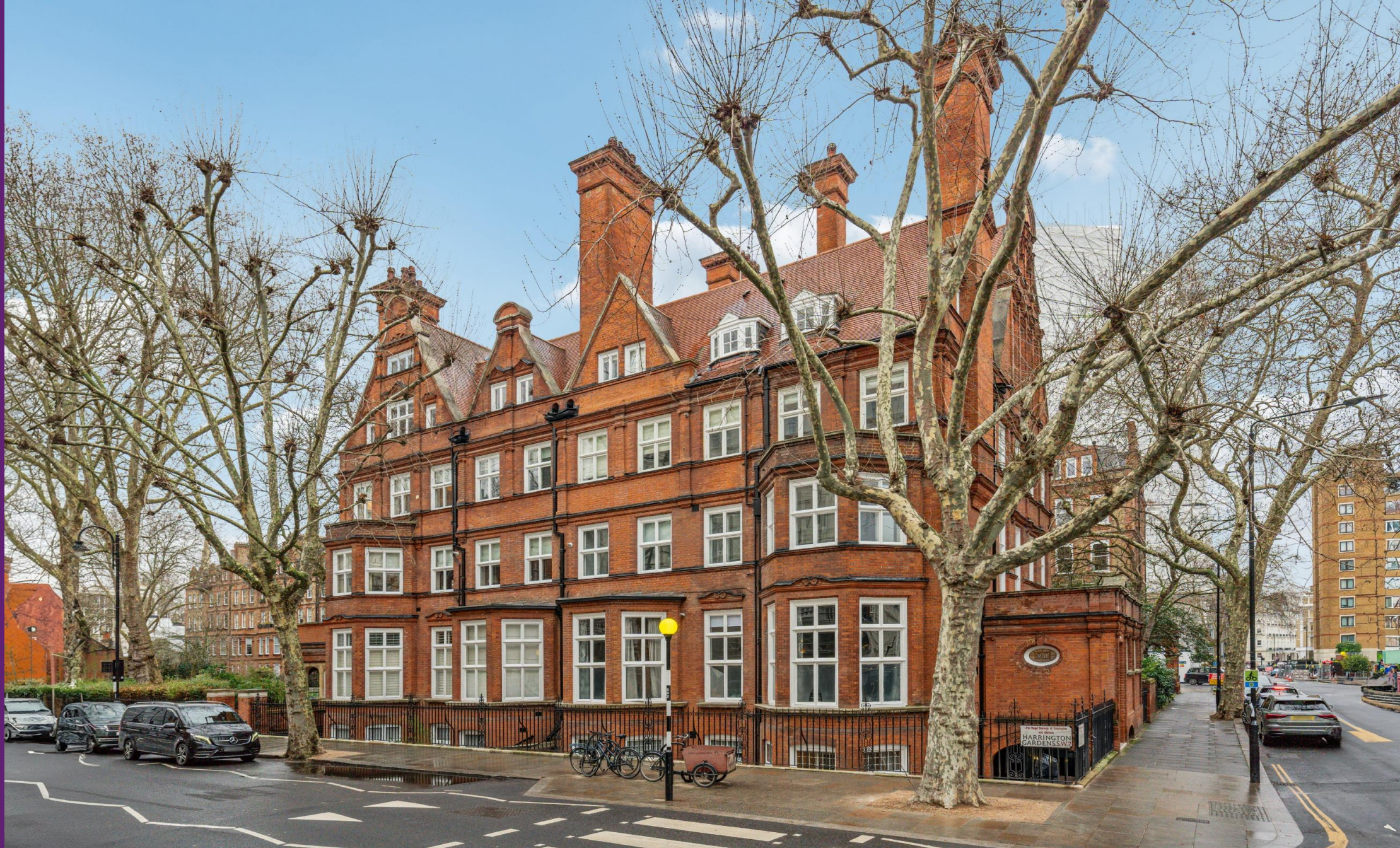
Platan House Harrington Gardens, South Kensington, SW7