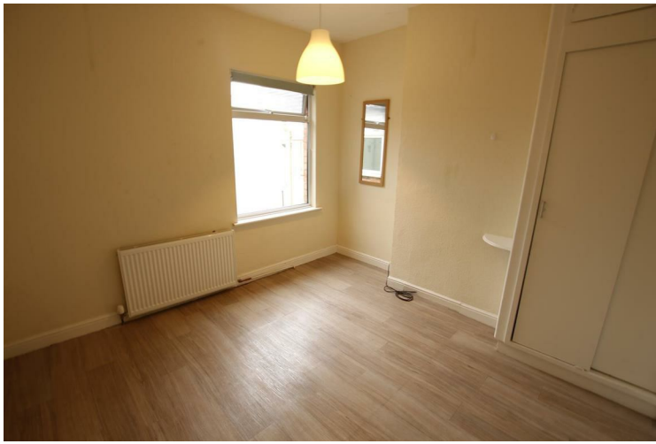
Bedroom Two 10'11" x 10'1" (3.350 x 3.089)