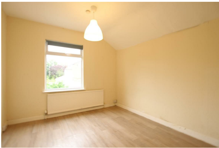
Bedroom Three 10'9" x 10'9" (3.300 x 3.292)