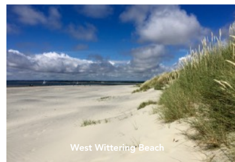
West Wittering Beach