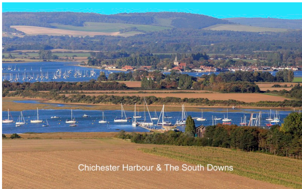
Chichester Harbour & The South Downs

A handsome Grade II listed Georgian terraced house superbly presented, featuring elegant tall ceilings comprising; 3 double bedrooms, 2 bathrooms, stunning sitting room, conservatory, kitchen/breakfast room and lovely private garden backing farmland, with an off street parking space, located in a village near Goodwood.