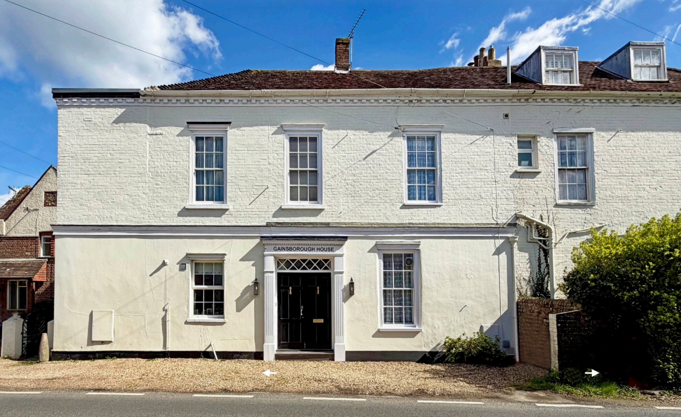
Gainsborough House Lavant, Chichester, West Sussex PO18 0BQ