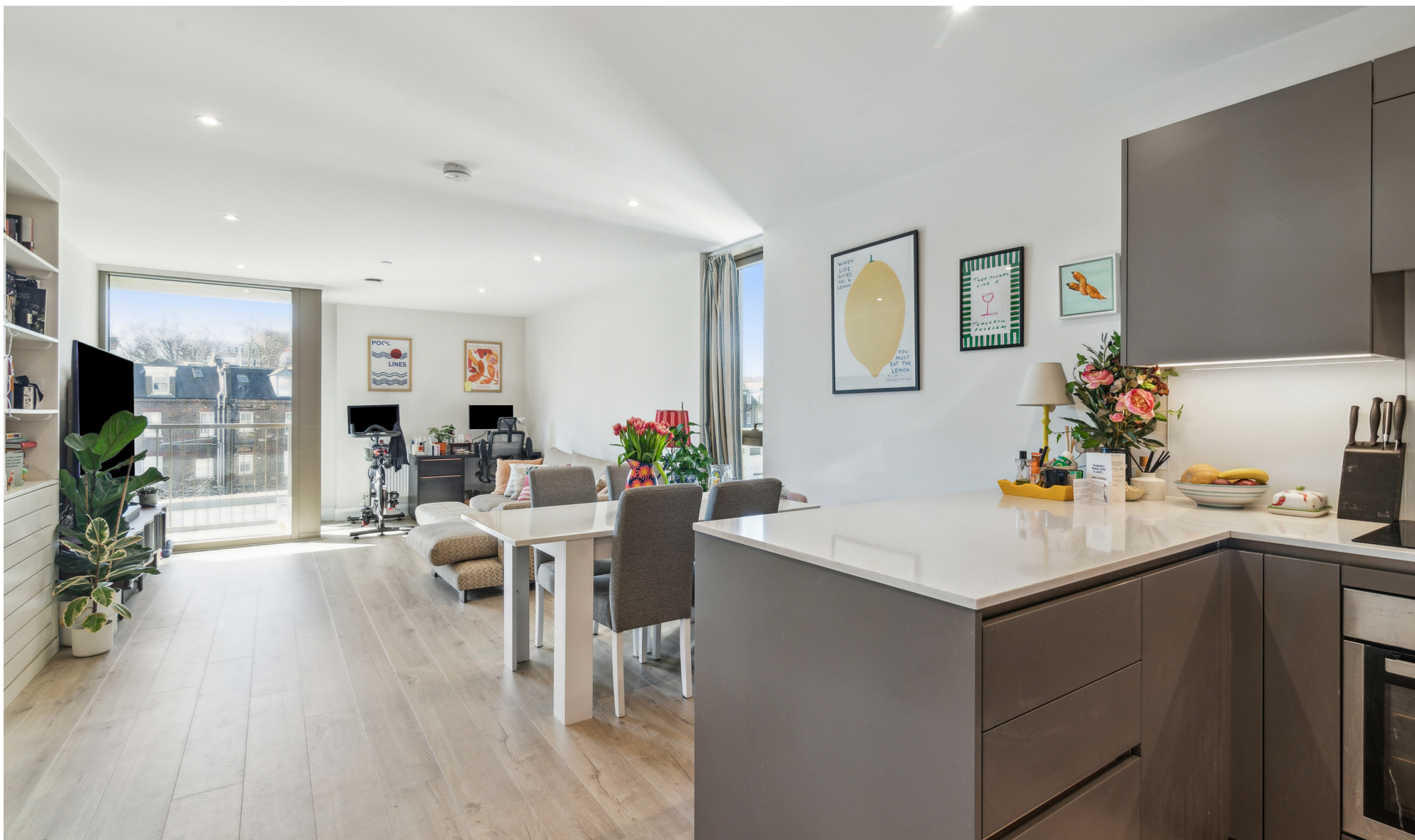
Warwick Lane Kensington W14