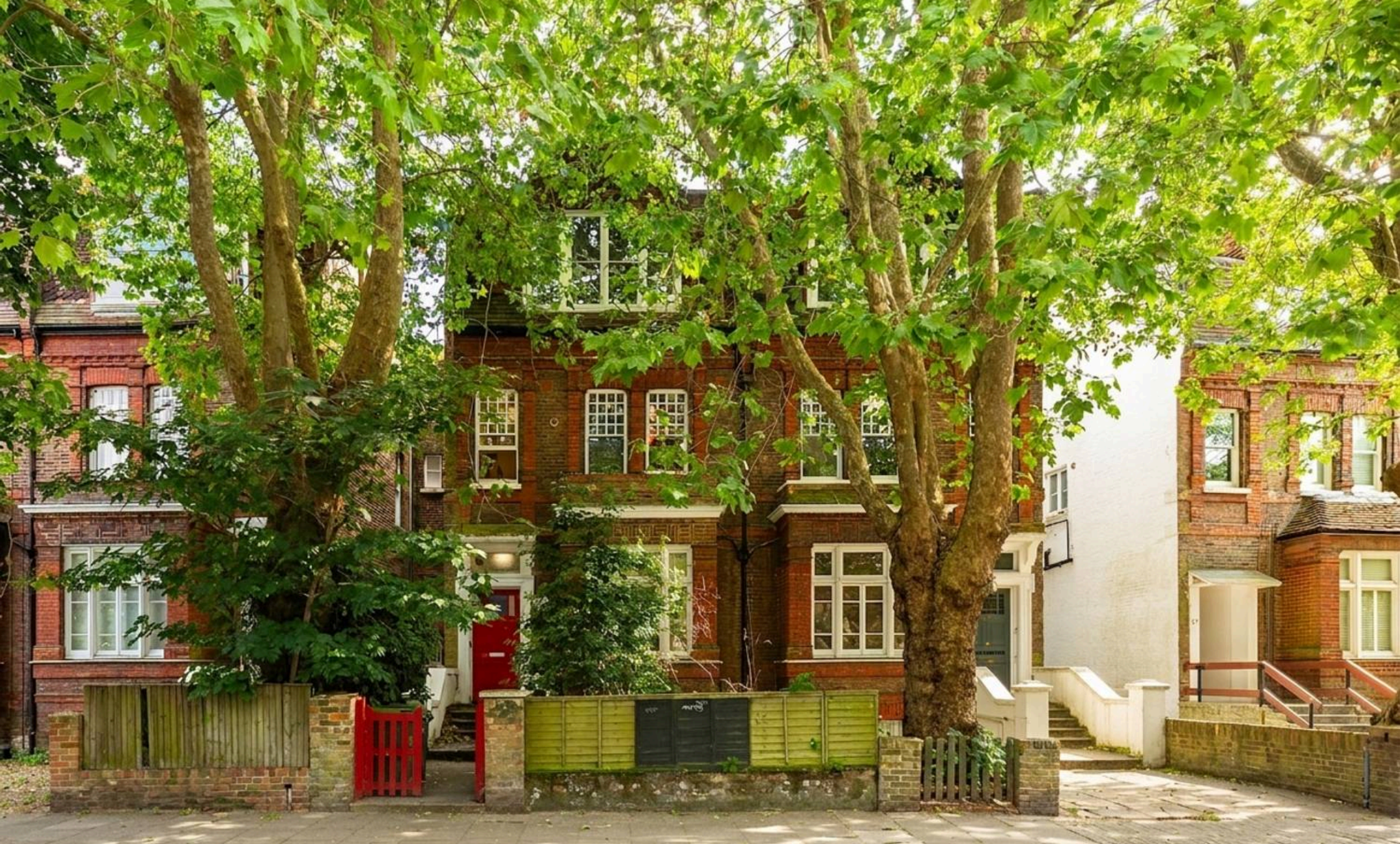
Broadhurst Gardens, South Hampstead, NW6. £4,150 pcm