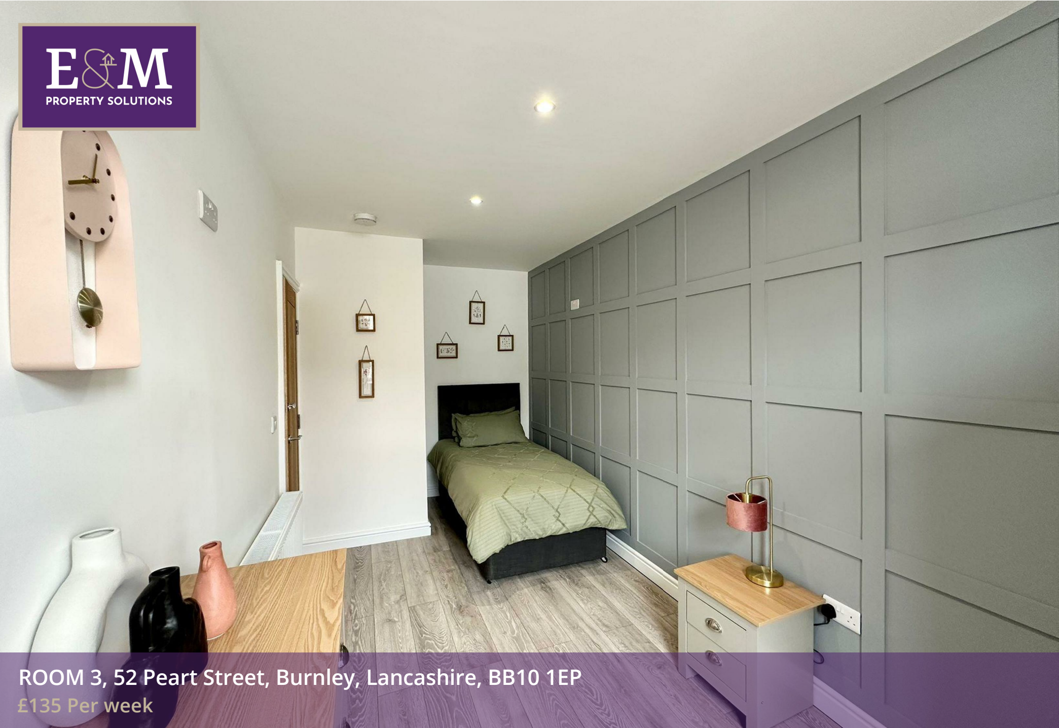
ROOM 3, 52 Peart Street, Burnley, Lancashire, BB10 1EP £135 Per week