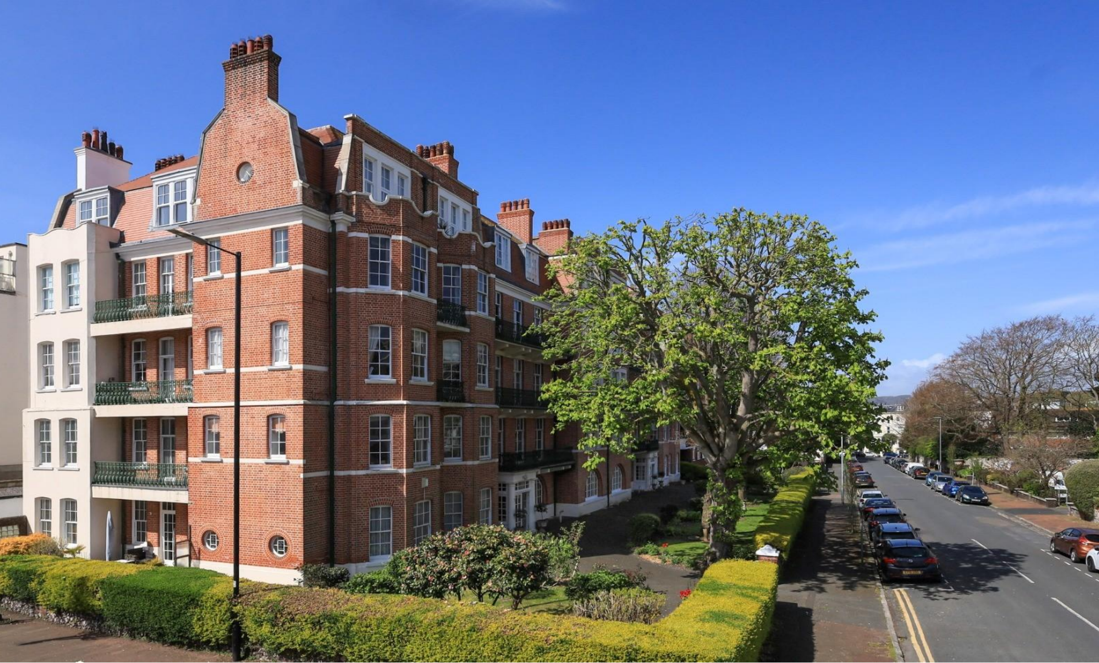
Hartington Mansions Hartington Place, Eastbourne BN21 3BJ