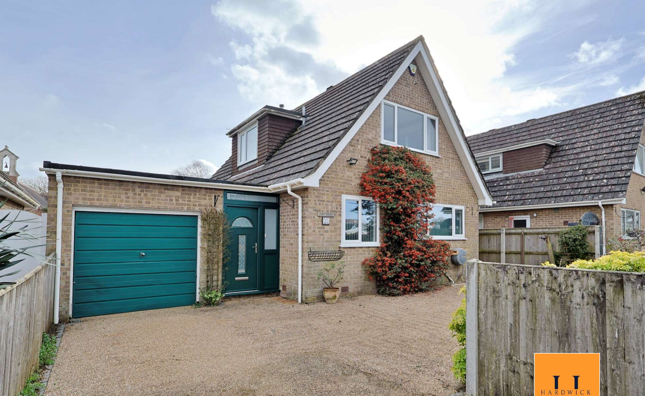
21 Violet Farm Close, Corfe Mullen, BH21 3DR