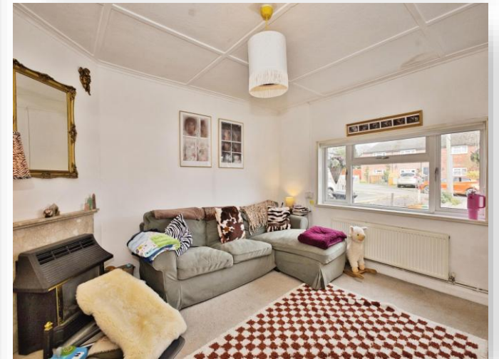
Lenthay Close, SHERBORNE, DT9 6AE