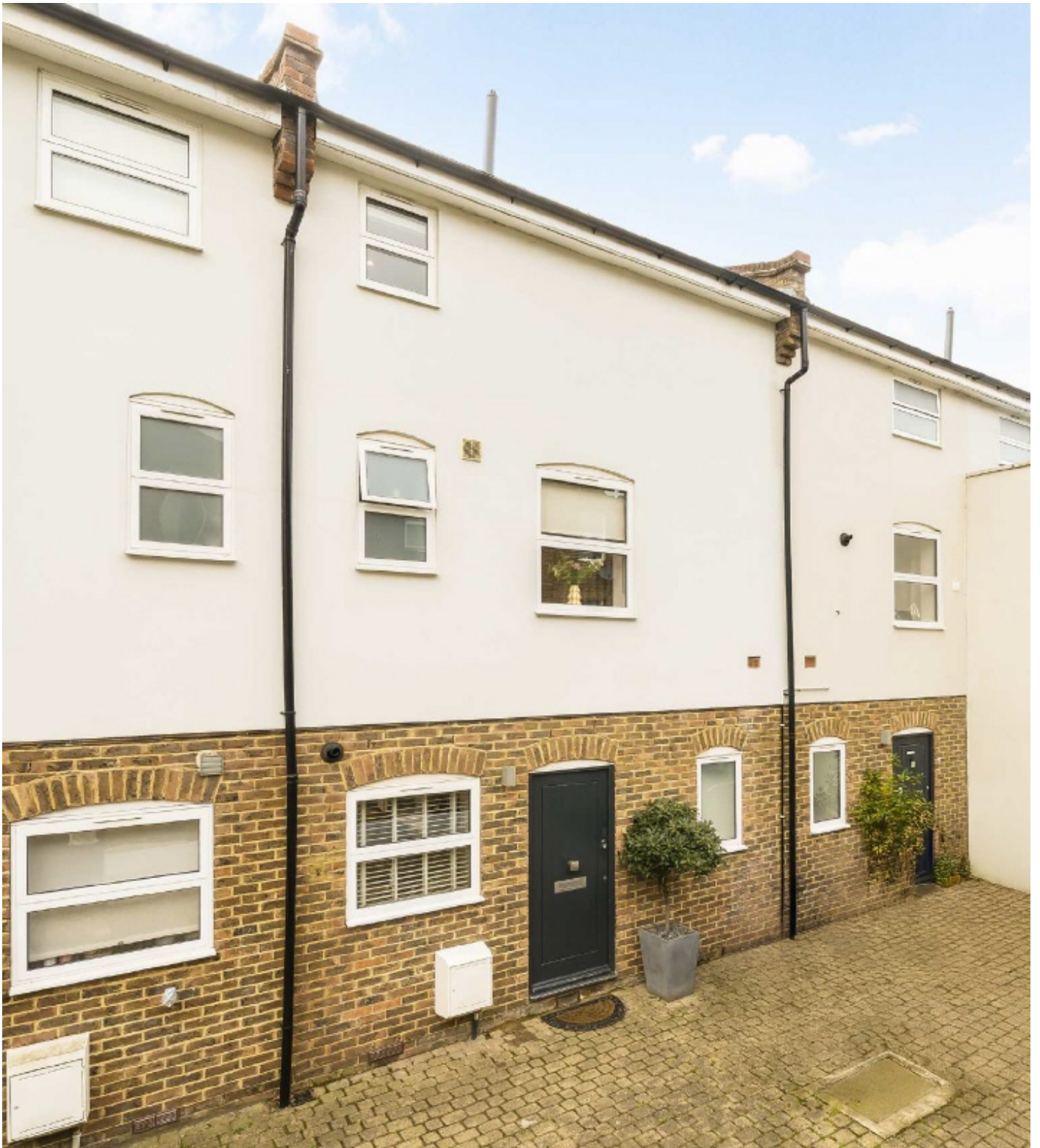
Abberley Mews, SW4 £815,000