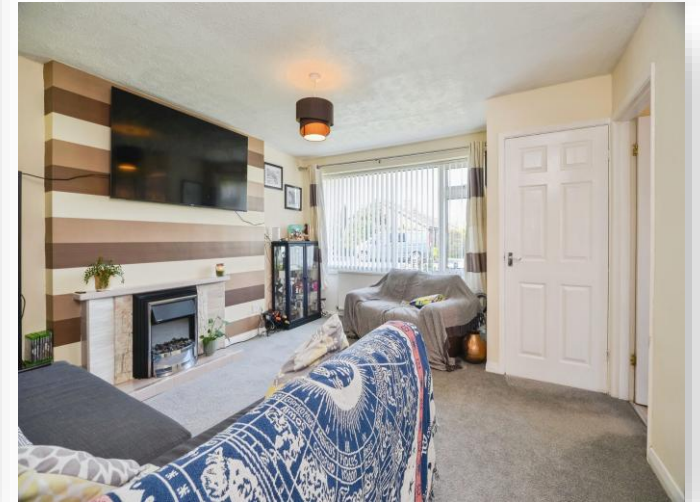
Sinnington Road, Thornaby Stockton-On-Tees TS17 0BX