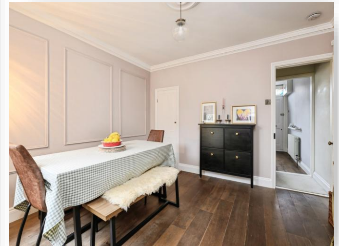
Chapel Street, Yaxley Peterborough PE7 3LN