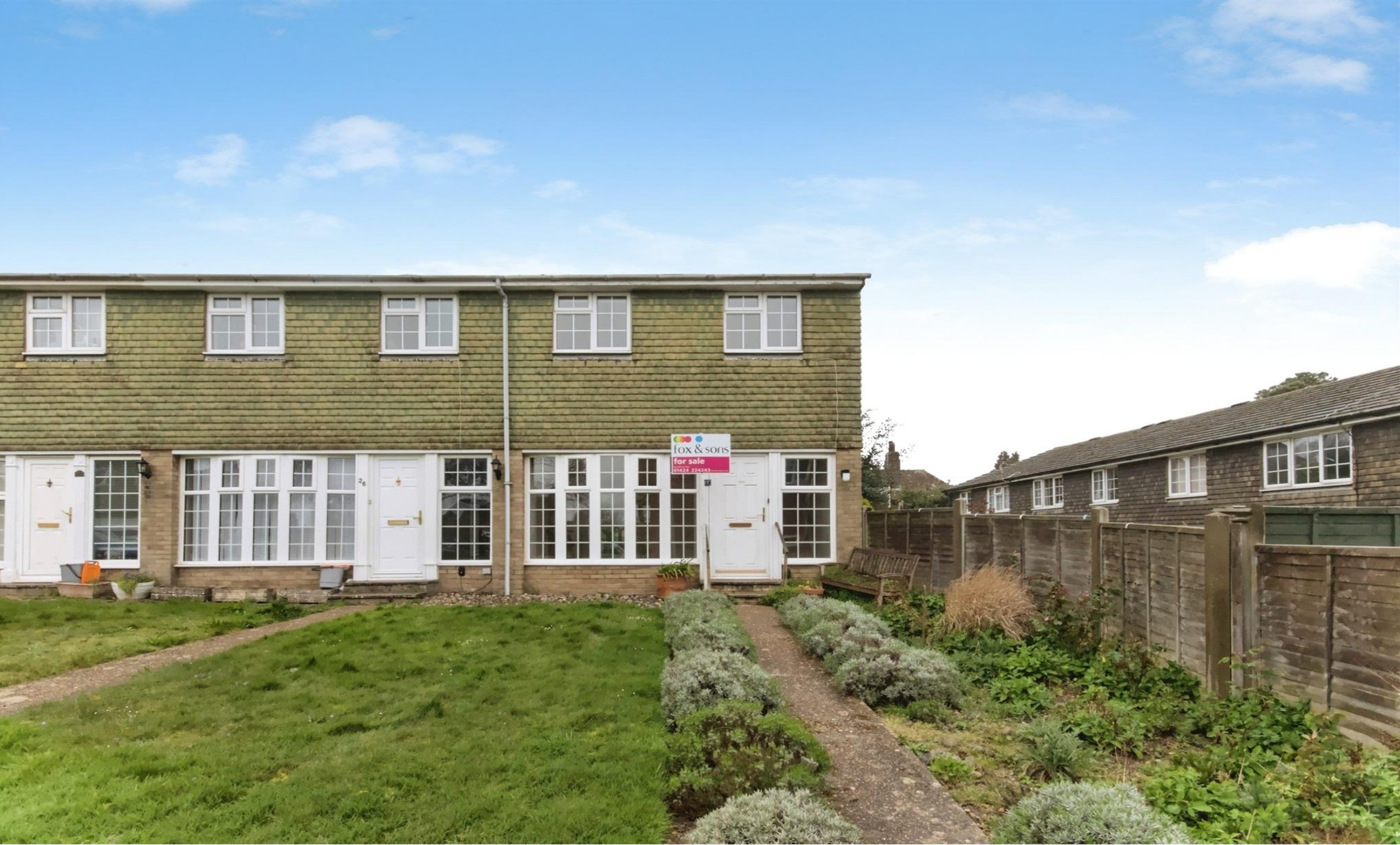
Quebec Close, Bexhill-On-Sea TN39 4HX