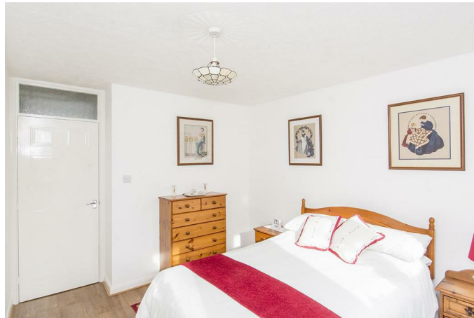
Bedroom One 11'6" x 12'9" (3.51 x 3.89)

11' 6" x 12' 9" max. (3.51m x 3.89m) Two UPVC double glazed windows to the front elevation. Wood laminate flooring. Radiator. Television point. Door to linen cupboard .