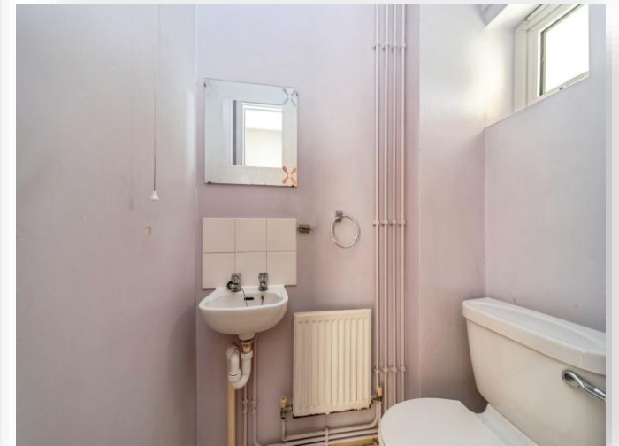
Hartwell Drive, Kempston, Bedford, MK42 8UU