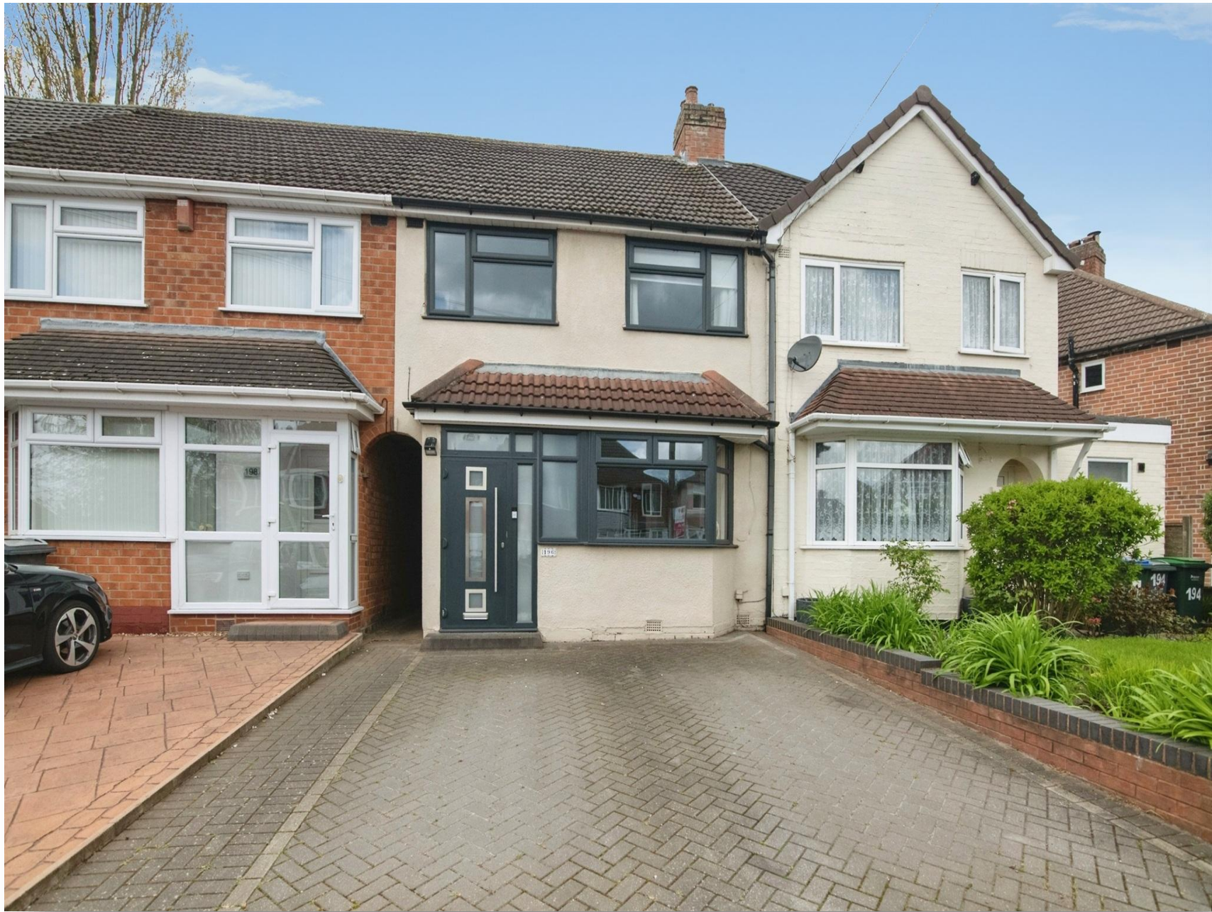
Waddington Avenue, Birmingham B43 5JE