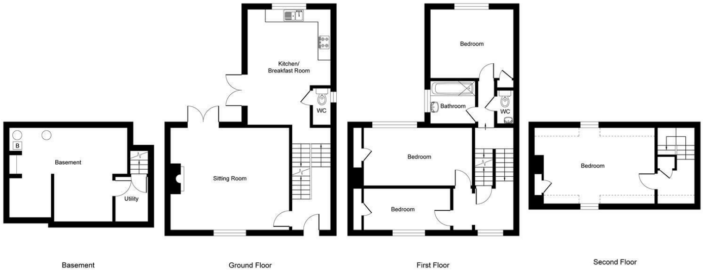
Illustration for identification purposes only, measurements approximate, not to scale. Copyright