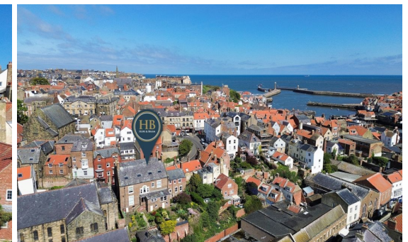
APARTMENT 5, ENDEAVOUR HOUSE- 2 bed Apartment -£165,000