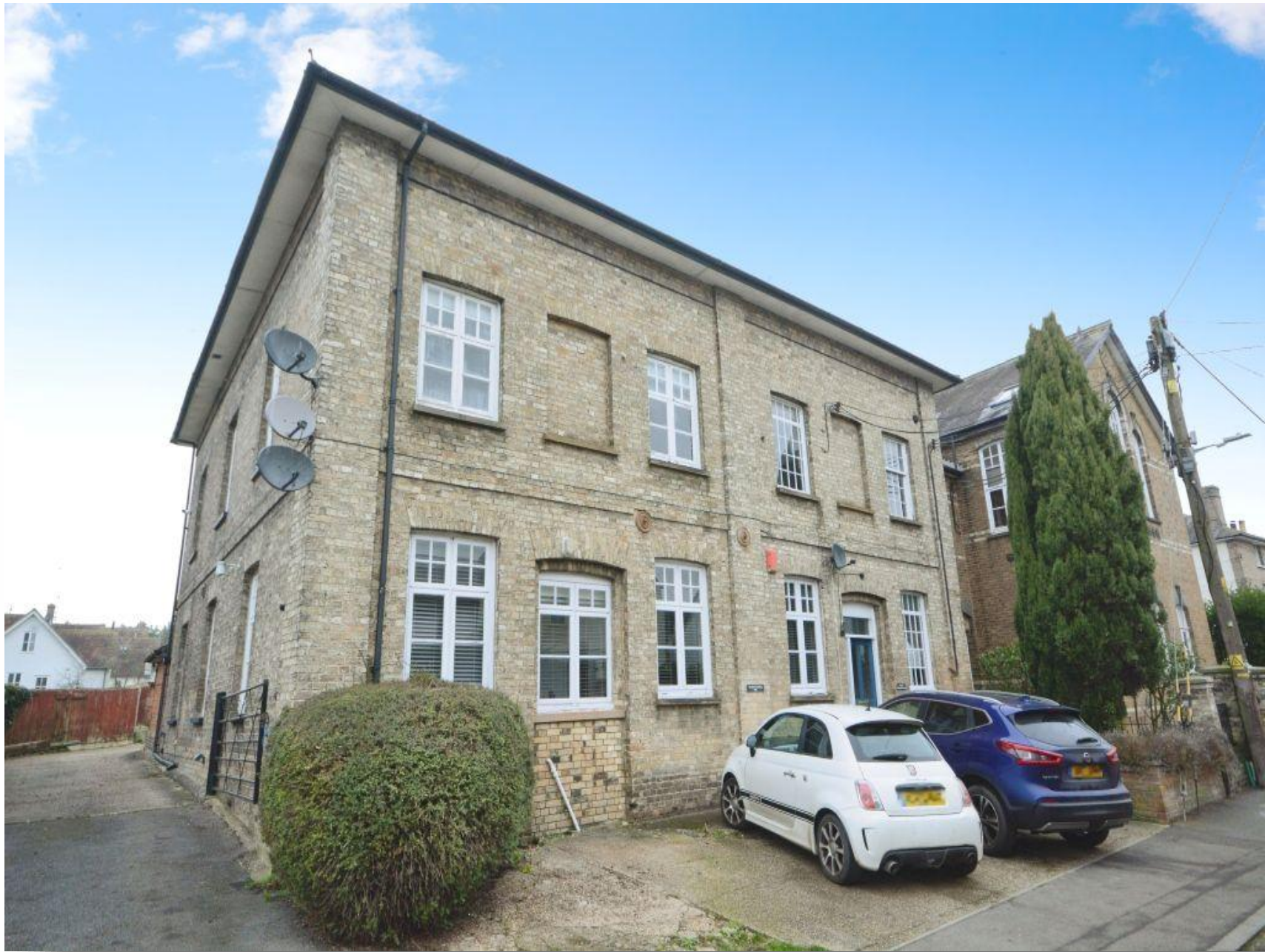
Bryan Dale House, Queen Street, Coggeshall, Colchester, CO6 1UF