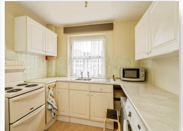
Sudley Gardens, Bognor Regis PO21 1HY