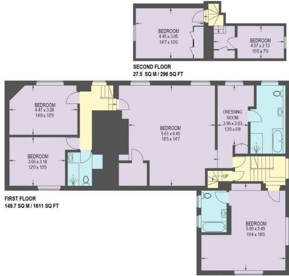
SECOND FLOOR 27.5 SQ M / 296 SQ FT