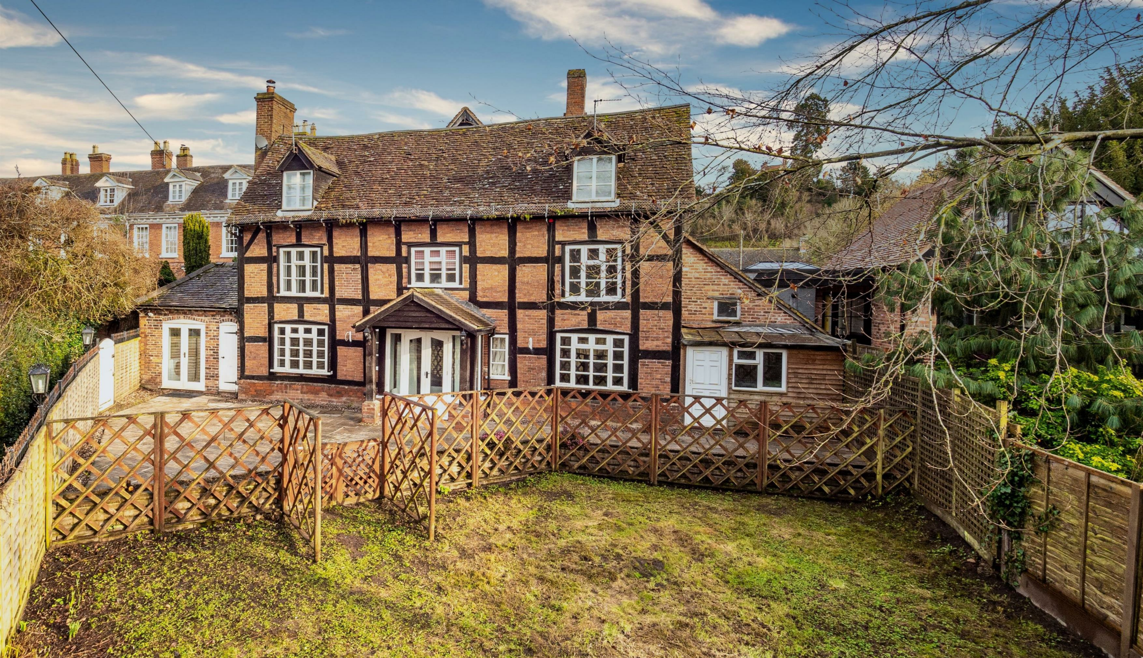
Bewdley | DY12 1AD