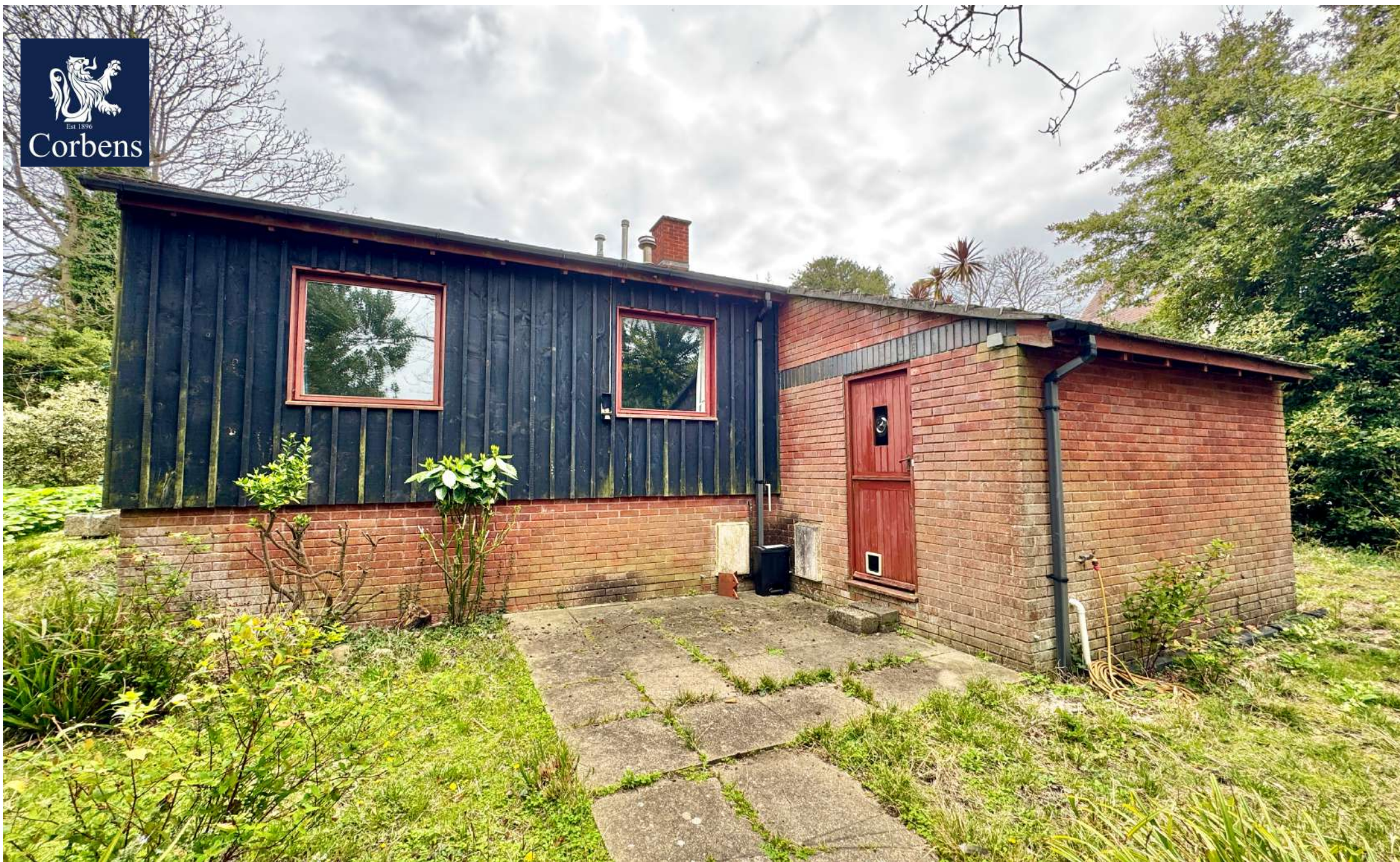
WARDENS BUNGALOW, 20 CLUNY CRESCENT, SWANAGE £550,000 Freehold