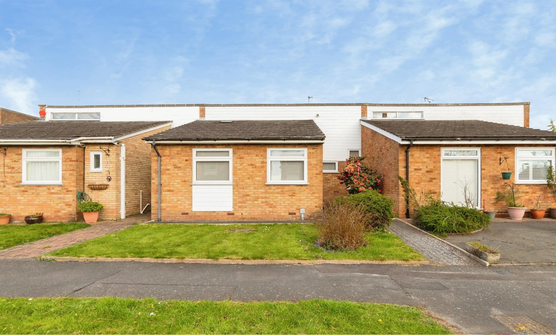
Barclay Close, Hertford Heath, Hertford, SG13 7RW