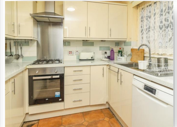
Martin Close, Neath Hill, Milton Keynes, MK14 6JG