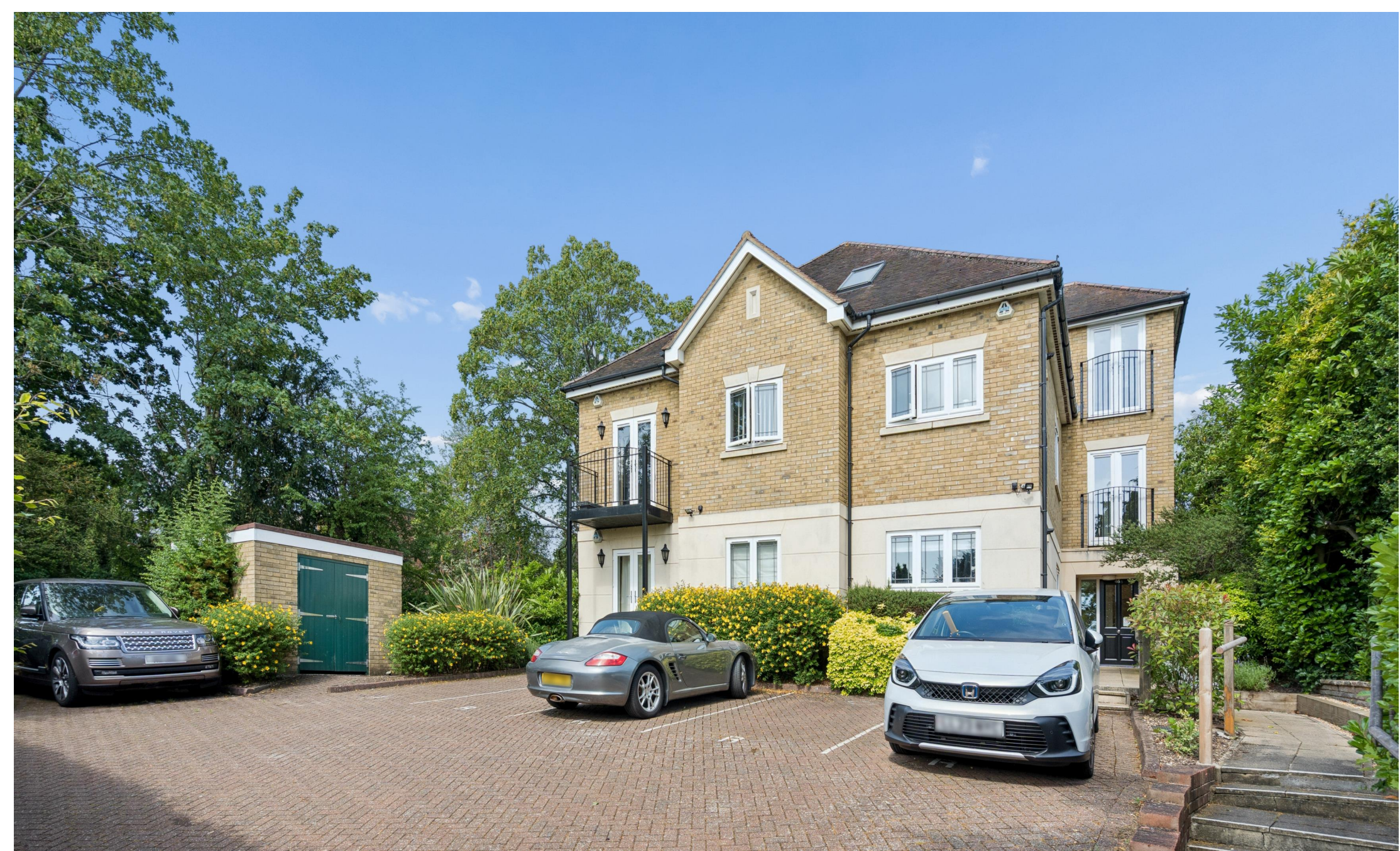
A three bedroom ground floor flat with a private garden Murray Road, Northwood, HA6 2YL