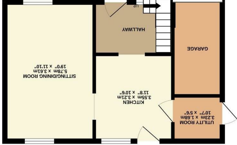
GROUND FLOOR 34.9 sq.m. (376 sq.ft.) approx.

TOTAL FLOOR AREA: 75.6 sq.m. (814 sq.ft.) approx.