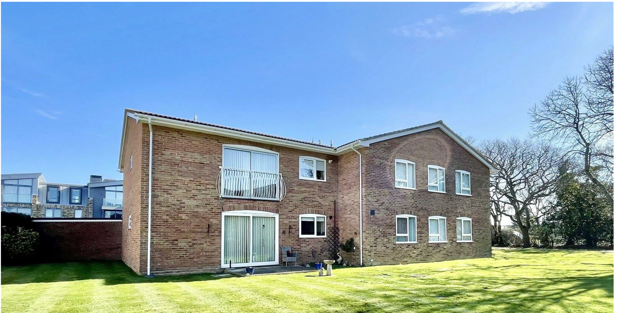
58 Montagu Park Waterford Place, Highcliffe On Sea BH23 £249,950