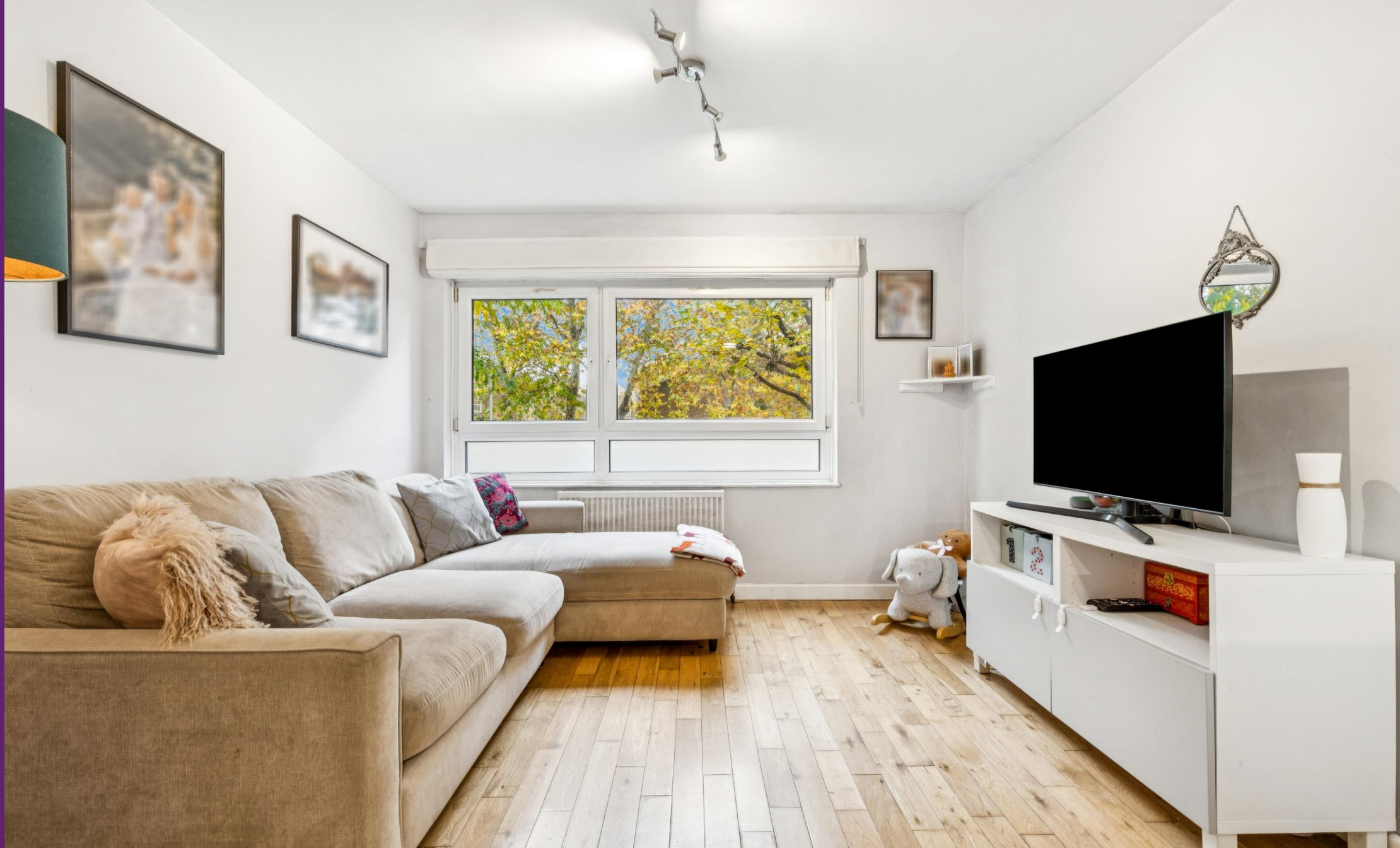
Bartholomew Close London, SW18