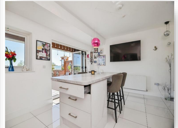
Infinity View, Stockton-On-Tees TS18 2FN