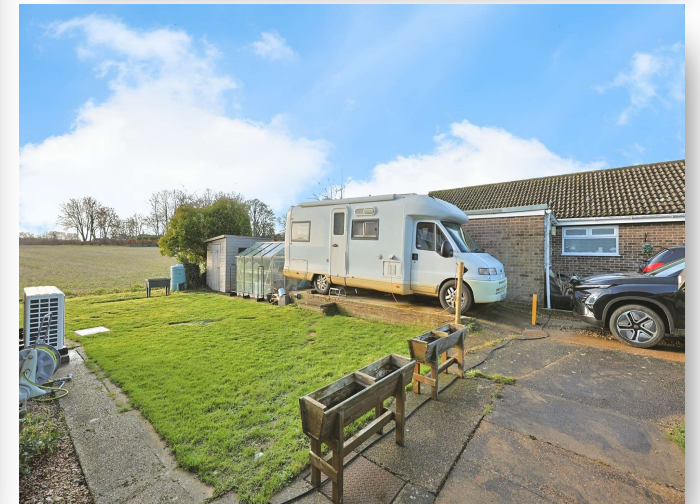
Bull Close, East Tuddenham, Dereham, NR20 3LX