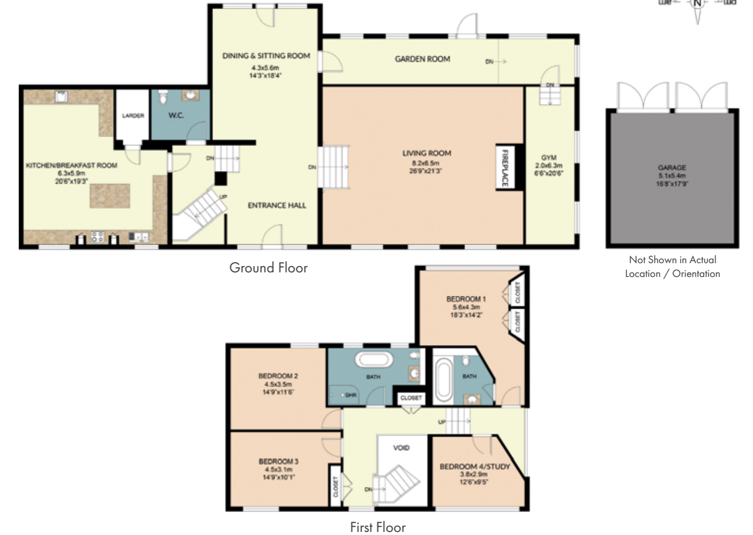
Not Shown in Actual Location / Orientation

Ground Floor: 1970 sq.ft / 183 sq.m First Floor: 1012 sq.ft / 94 sq.m Garage: 301 sq.ft / 28 sq.m Total Area: 3283 sq.ft / 305 sq.m