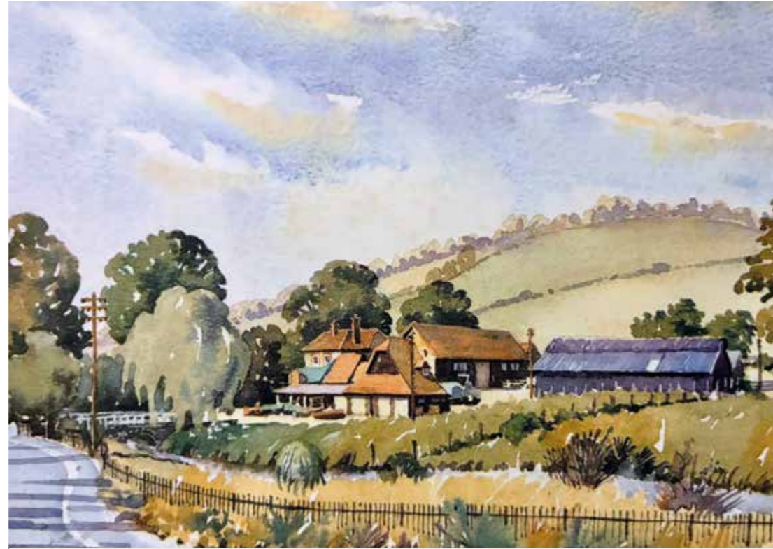
Watercolour painting of the property from its working farm days.