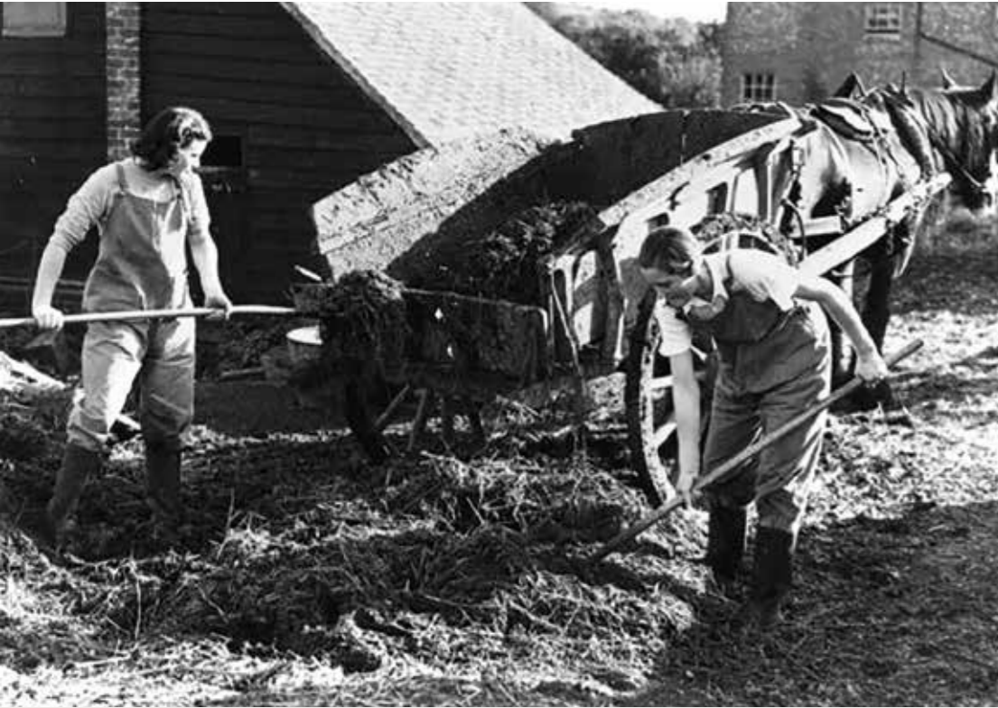
Land girls working on the land beside the barn during WWII.