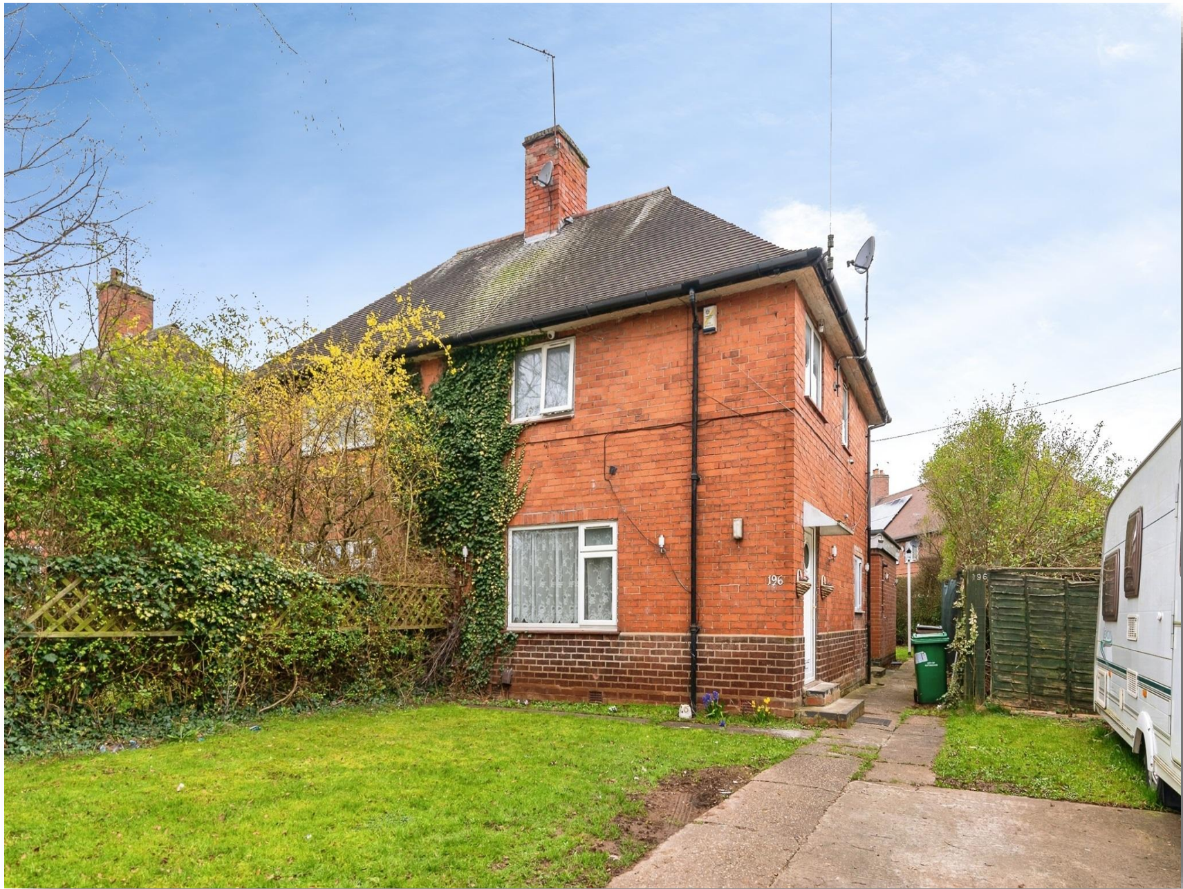
Broxtowe Lane, Nottingham NG8 5NA