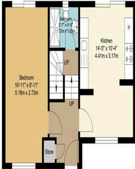
Ground Floor Approximate Floor Area 395.14 sq. ft. (36.71 sq. m)