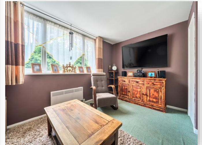
Ray Lodge Mews, Maidenhead SL6 8NF