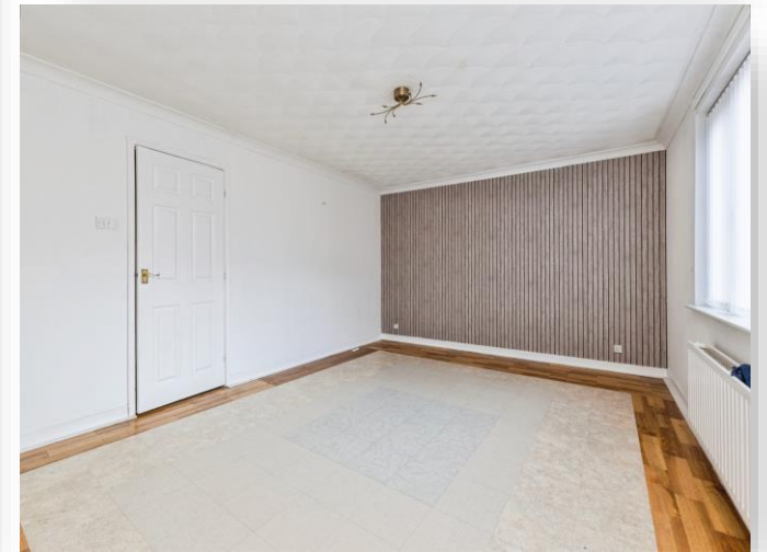
Ashbrooke Court, Hutton Henry, TS27 4QY